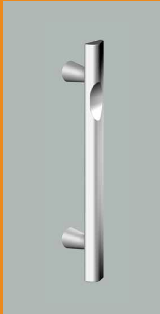
Delta 623 on standard pillars