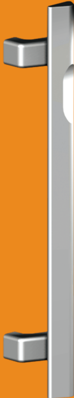
Delta 622 on offset pillars