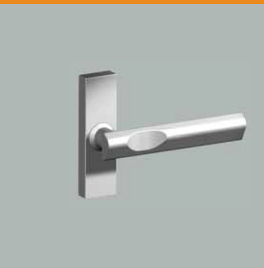
Delta 631 on A1-10 plate