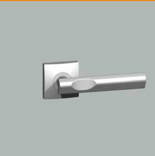
Delta 631 on S rose