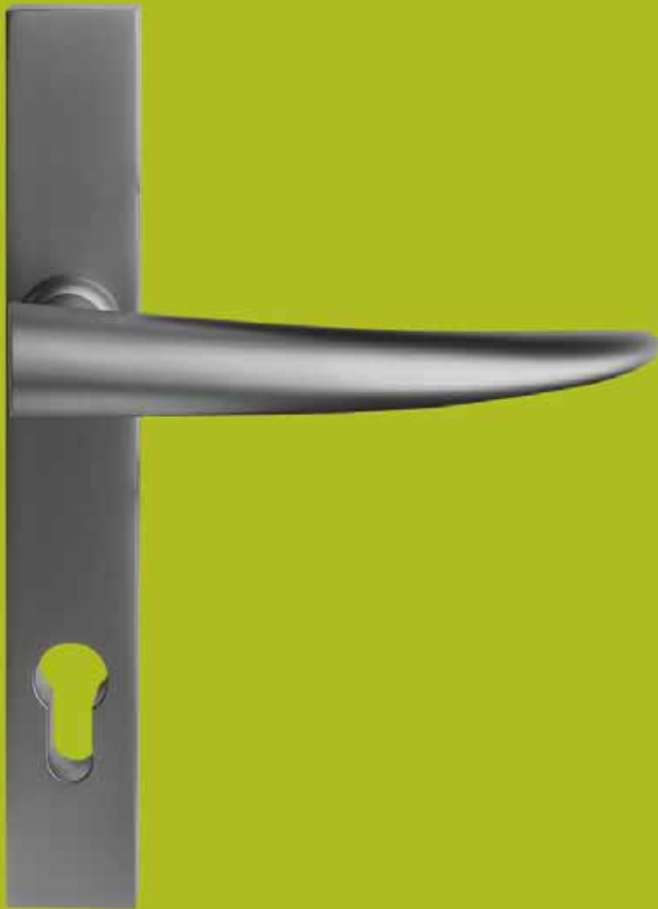
Nile PM25 on A1-21 plate

For information on Mason Lever Handles on Plates, refer to Technical Section.