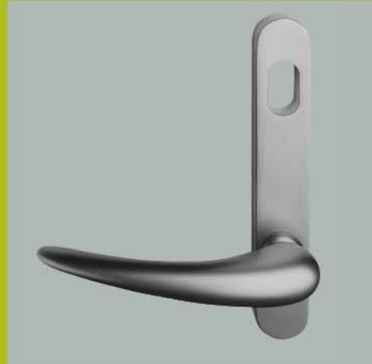
Comma PM35 on A3-51 plate