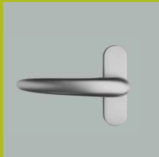
Rib PM44 on A3-10 plate