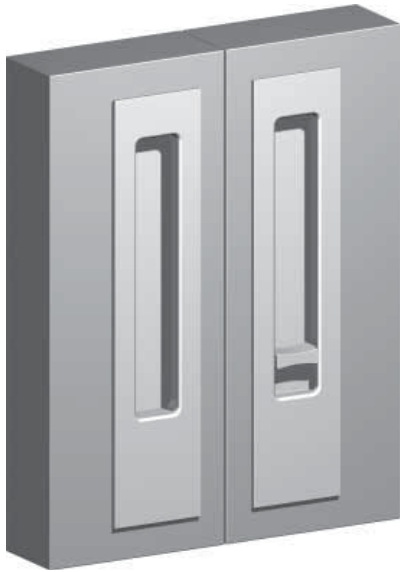
1461S example 50mm x 200mm Style 1