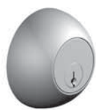
Cylinder Escutcheon A