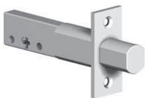
Deadbolt 1176 60 – 70mm C